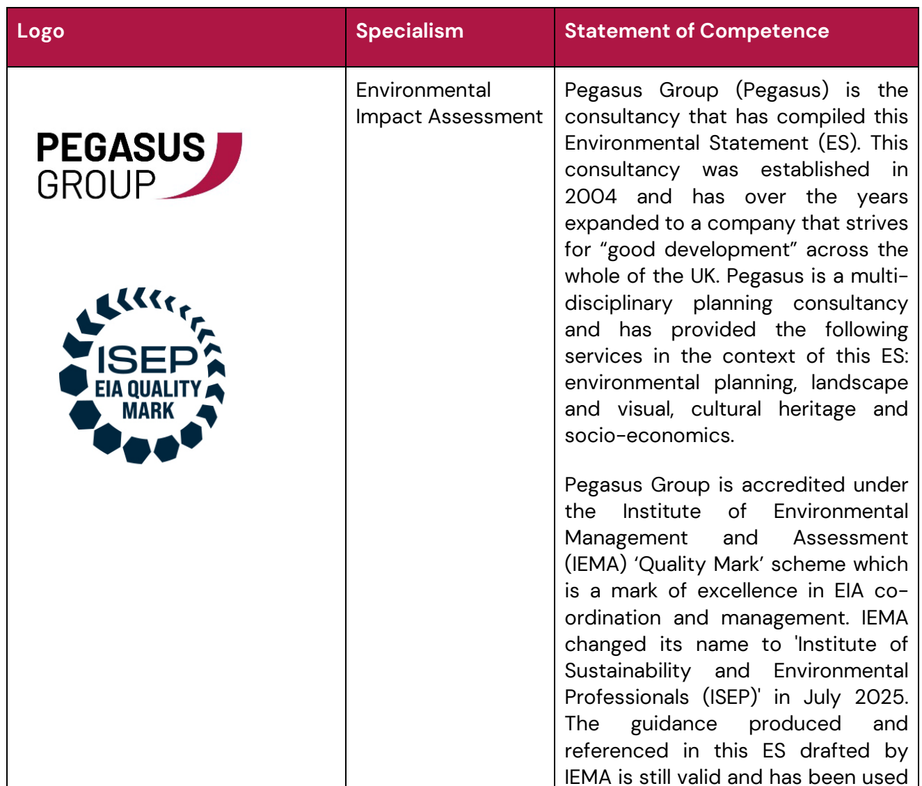
Table 1.1 – Statement of Competence