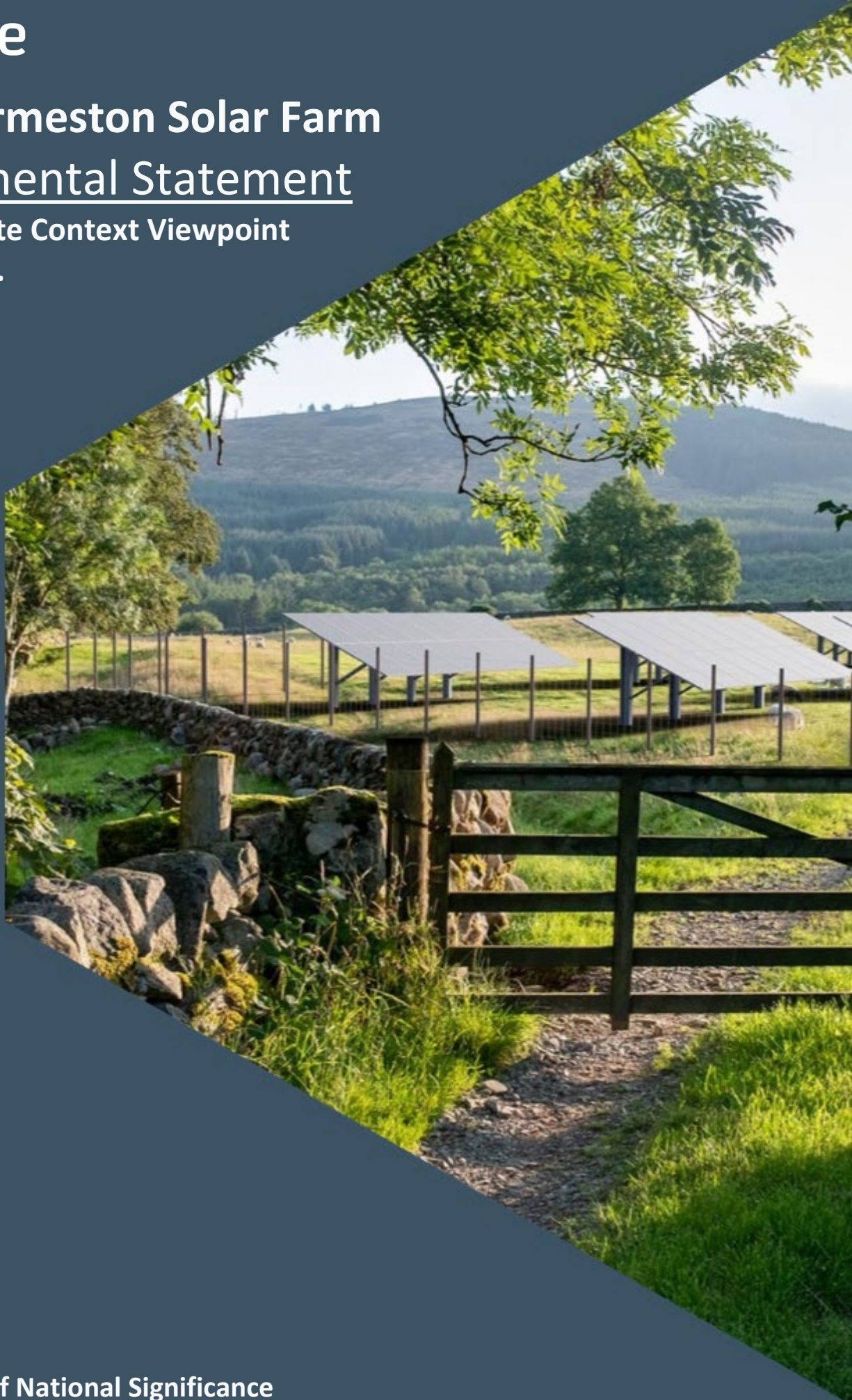
Figure 5.10 Site Context Viewpoint Location Plan.